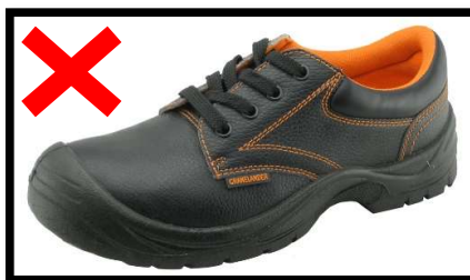
Low-cut Safety Shoes

All Personnel are reminded to wear the correct size safety footwear properly. Footwear shall be regularly inspected by user for its condition and replace immediately if there are signs of wear and tear.